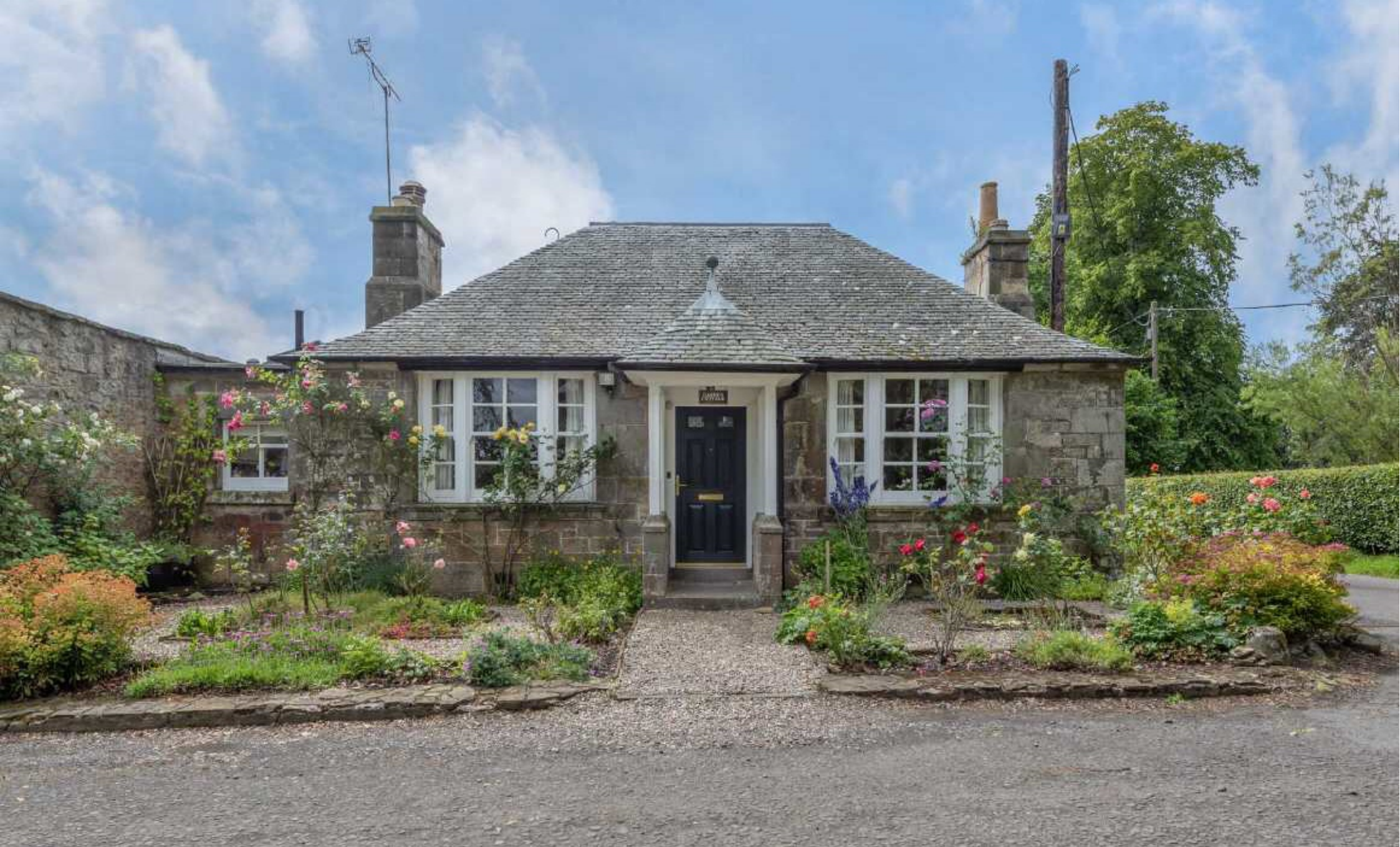
Garden Cottage, | Blebo Craigs | KY15 5TZ