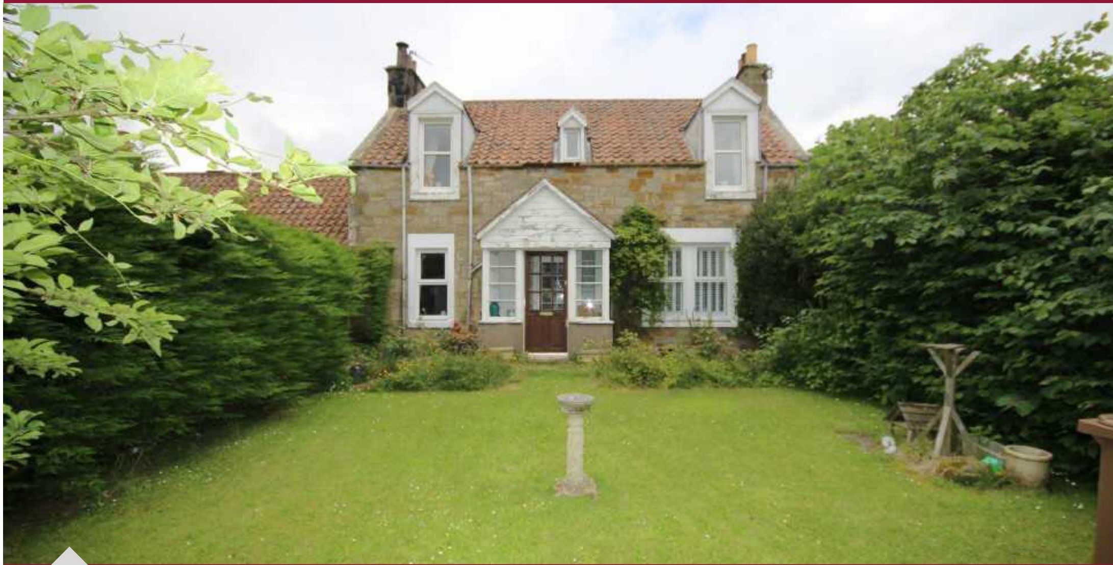
Gladney House, 10 Gladney, Ceres, KY15 5LT Fixed asking price £285,000