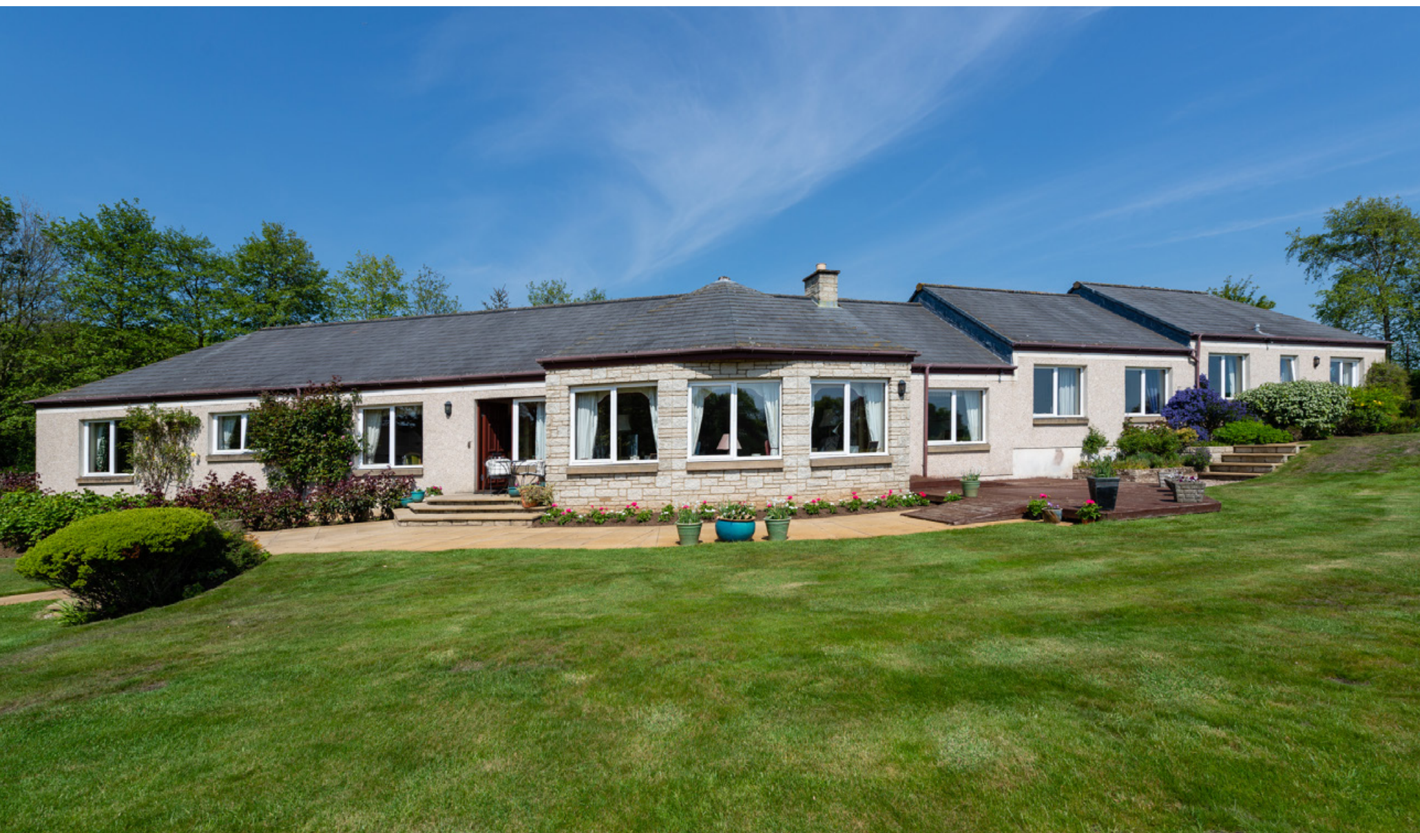
Taylor's Brae, Charleton Estate, By Colinsburgh, KY9 1HG Offers Over £500,000