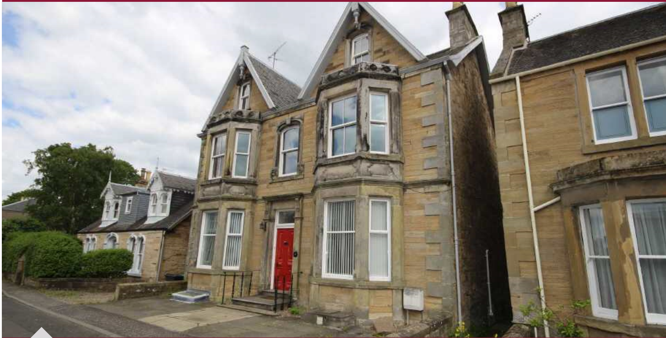
Upper Kinnear House, North Union Street, Cupar, KY15 4DU Offers over £220,000