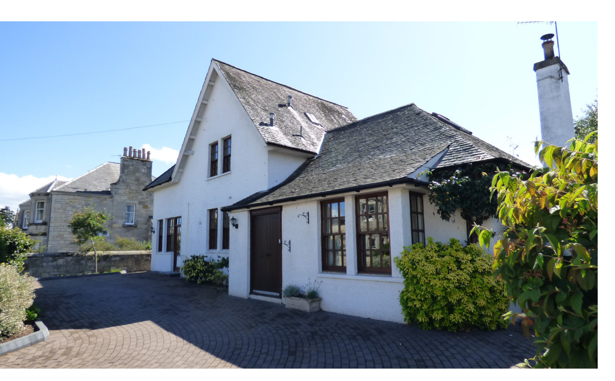
The White Lodge, 94 Hepburn Gardens, St Andrews, Fife, KY16 9LT