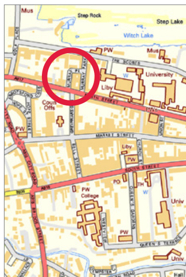
Contains Ordnance Survey data © Crown copyright and database 2017

Thorntons is a trading name of Thorntons Law LLP.