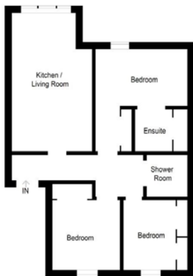
Illustrative only. Not to scale