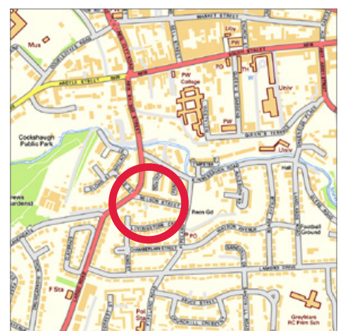
Contains Ordnance Survey data © Crown copyright and database 2017